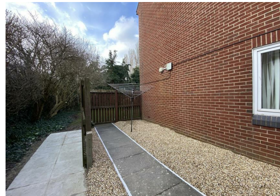
Residents Parking Communal Gardens